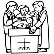
I baptize you in the name of the Father and of the Son and of the Holy Spirit